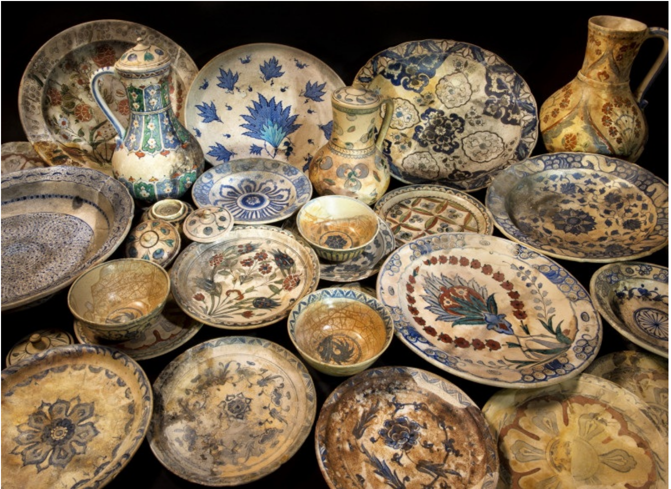
Iznik pottery