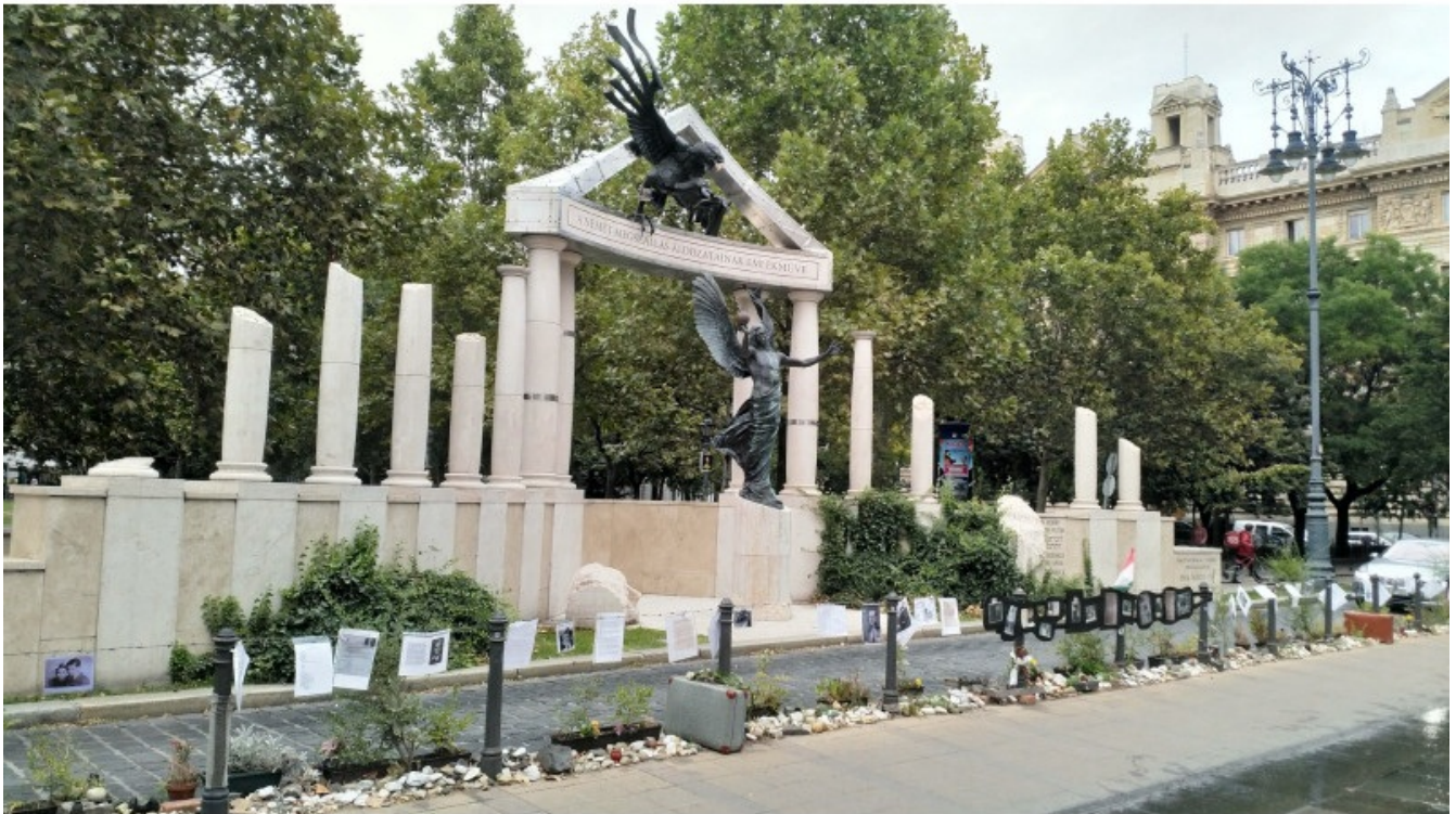
3 / 3 Memorial for the Victims of German Occupation in Budapest

* This project has received funding from the European Research Council (ERC) under the European Union's Horizon 2020 research and innovation programme (GMM - grant agreement No 816784).