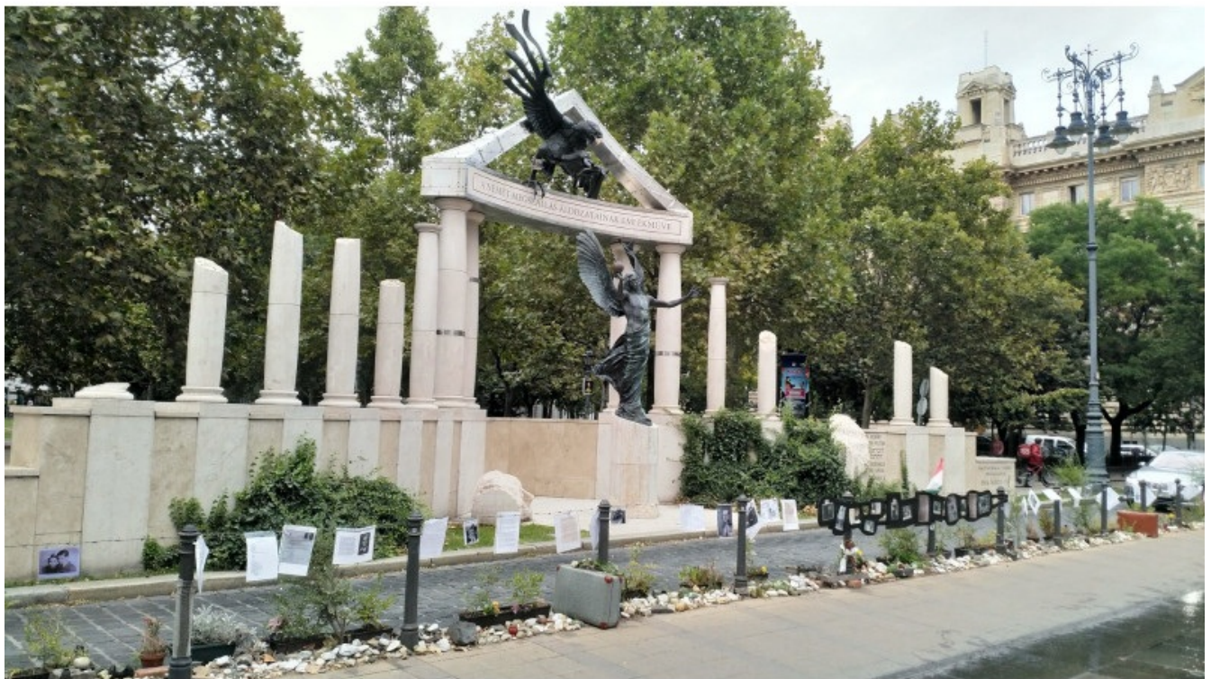
3 / 3 Memorial for the Victims of German Occupation in Budapest

* This project has received funding from the European Research Council (ERC) under the European Union's Horizon 2020 research and innovation programme (GMM - grant agreement No 816784).